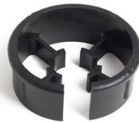
Stabilizer - 23" Commercial Fountain

This stabilizer is for the Quick Set tier system which means that it will only work on tiersets where the tiers simply slide down and rest on a ledge and are not screwed on to the centre cylinder.