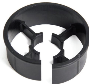
Stabilizer - 34/44" Commercial Fountain

Stabilizers come with all purchased Sephra chocolate fountains, however replacements are available as they commonly get lost or broken.