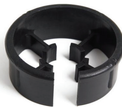
Stabilizer - 27" Commercial Fountain